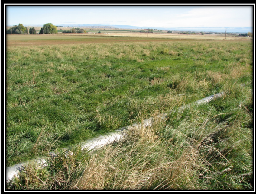
Irrigated Farm Ground